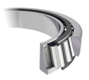
Single-row tapered roller bearing