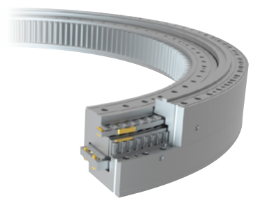
Three-row roller bearing

There are different vertical and horizontal boring machines to suit different usage scenarios. These machines work with roller bearings, which are specially made to meet these demands.