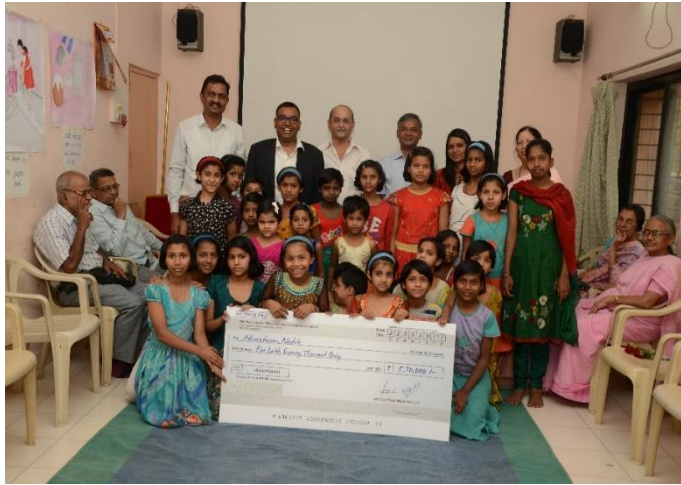
Together with working committees of Adharsharm, Nashik