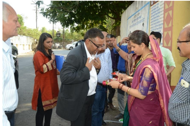
Handing over the cheque to working committees of NGO's and site visit.