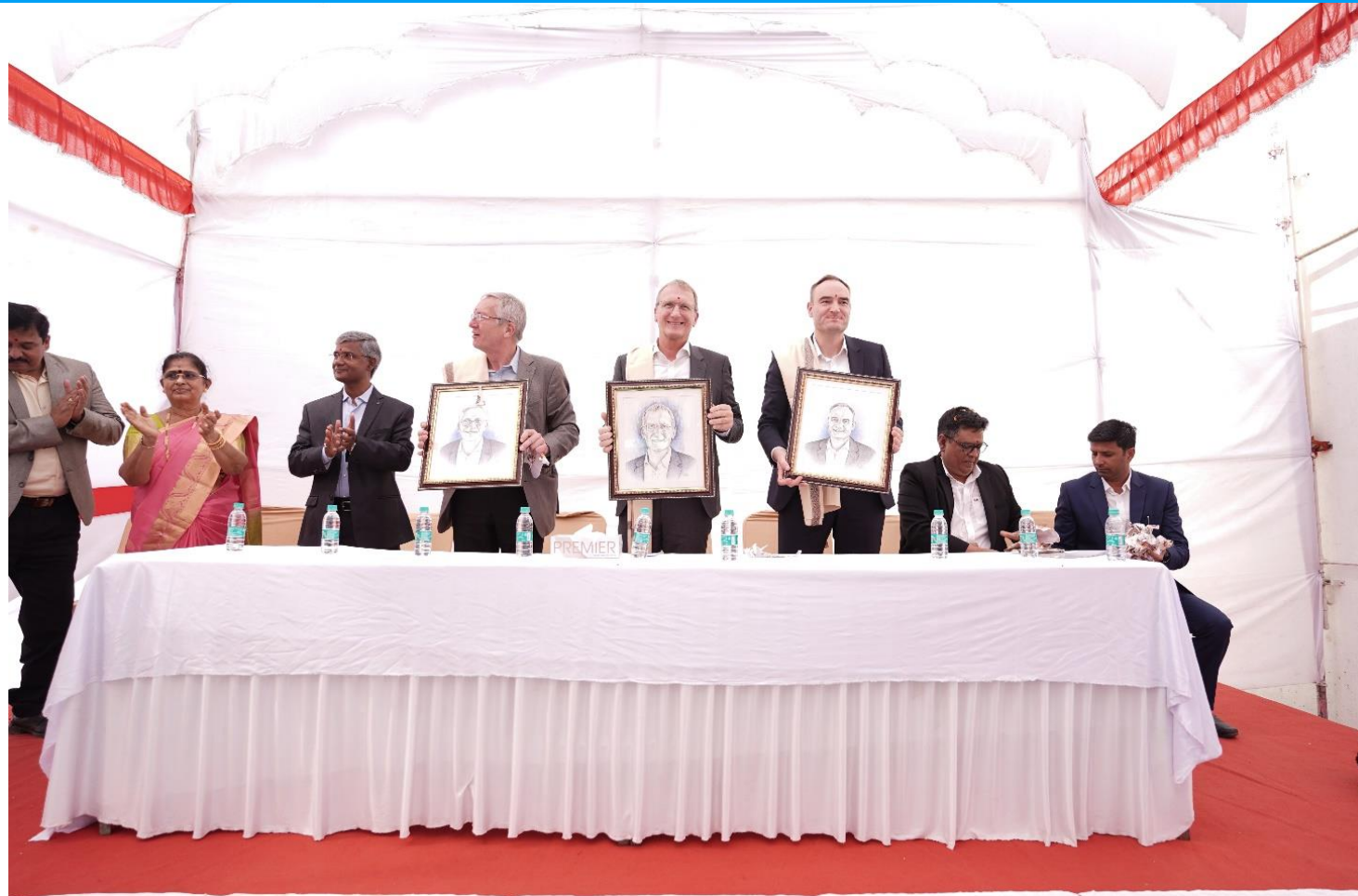
Felicitation ceremony by the school trustees.

inaugurated by the thyssenkrupp rothe erde executive Board