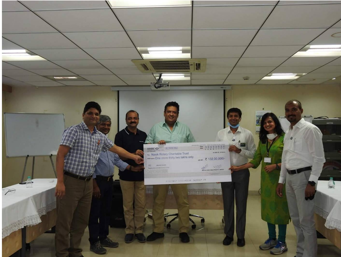
Handing over the cheque to Rotary Charitable Trust.