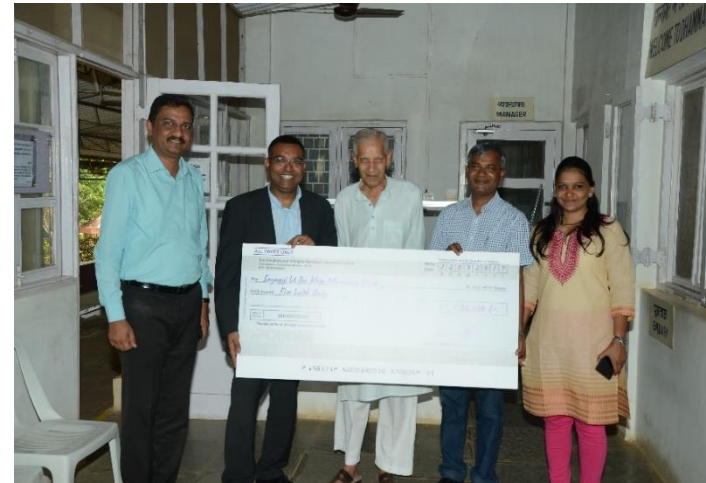
Handing over the cheque to Sayagi U Ba Khin Memorial Trust