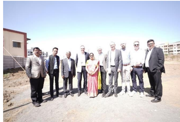
Plantation in the school premises by the board and management team.