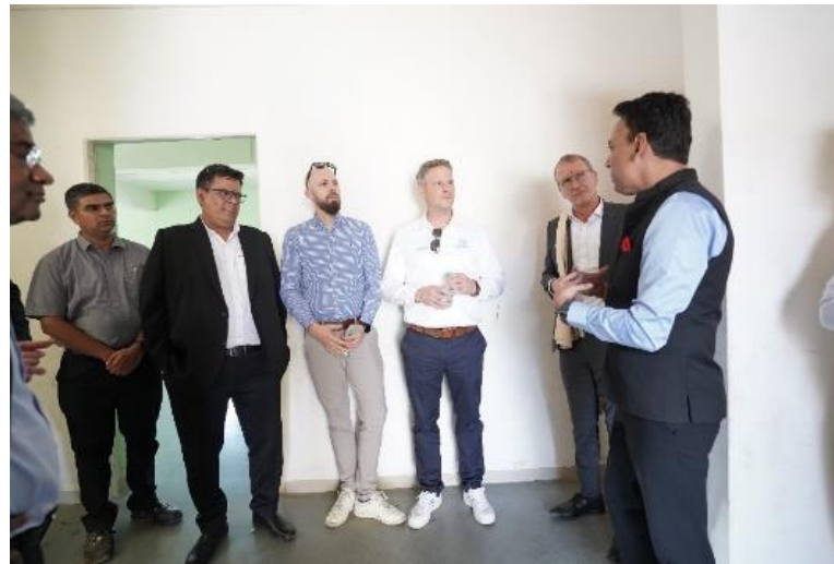
Hostel tour for the board and management.