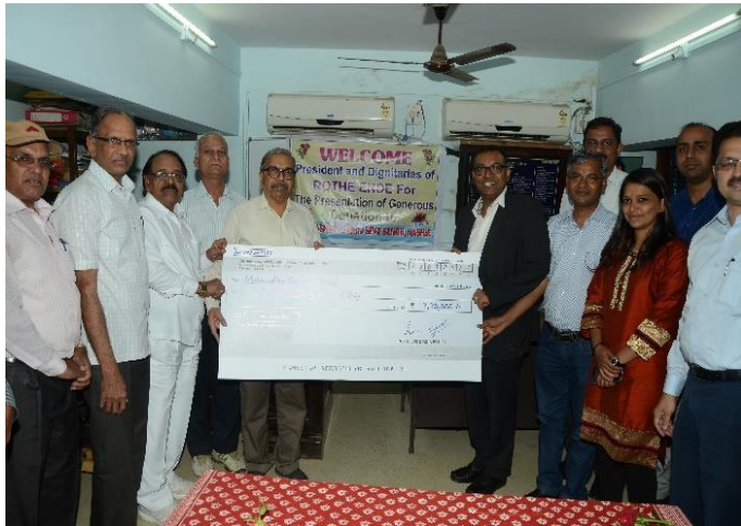
Handing over the cheque to working committees Maharashtra Samajseva Sangh, Nashik